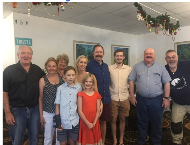
AAA members and friends attending the American Legion's luncheon held at the Redlands Sporting Club on Sunday 24 th November 2019.