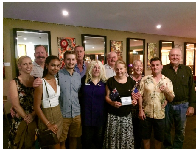
A happy group of AAA members and friends enjoying our Monthly Social Drinks Meetup held on Friday 15 th November at the "Pullman Hotel".