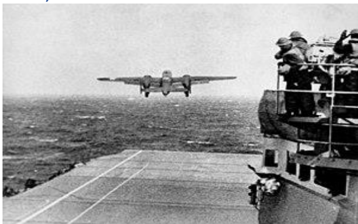
A B-25B taking off from USS Hornet for the raid