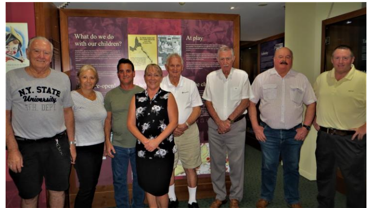
Your 2019 – 2020 AAA Brisbane Committee -