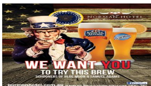
The Norman Hotel